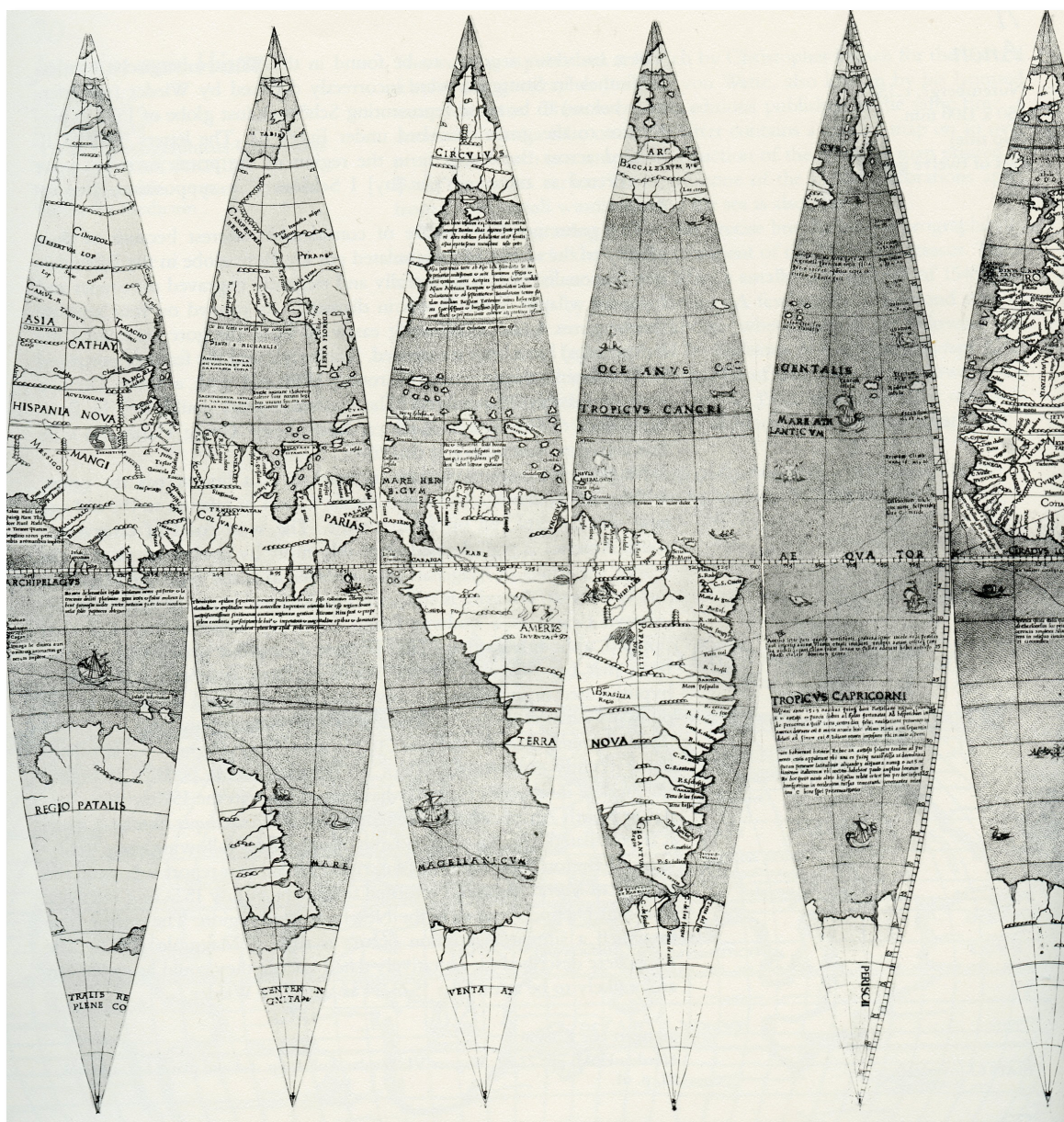
Anonymous globe gores, 1535 Shirley #71, Plate 63