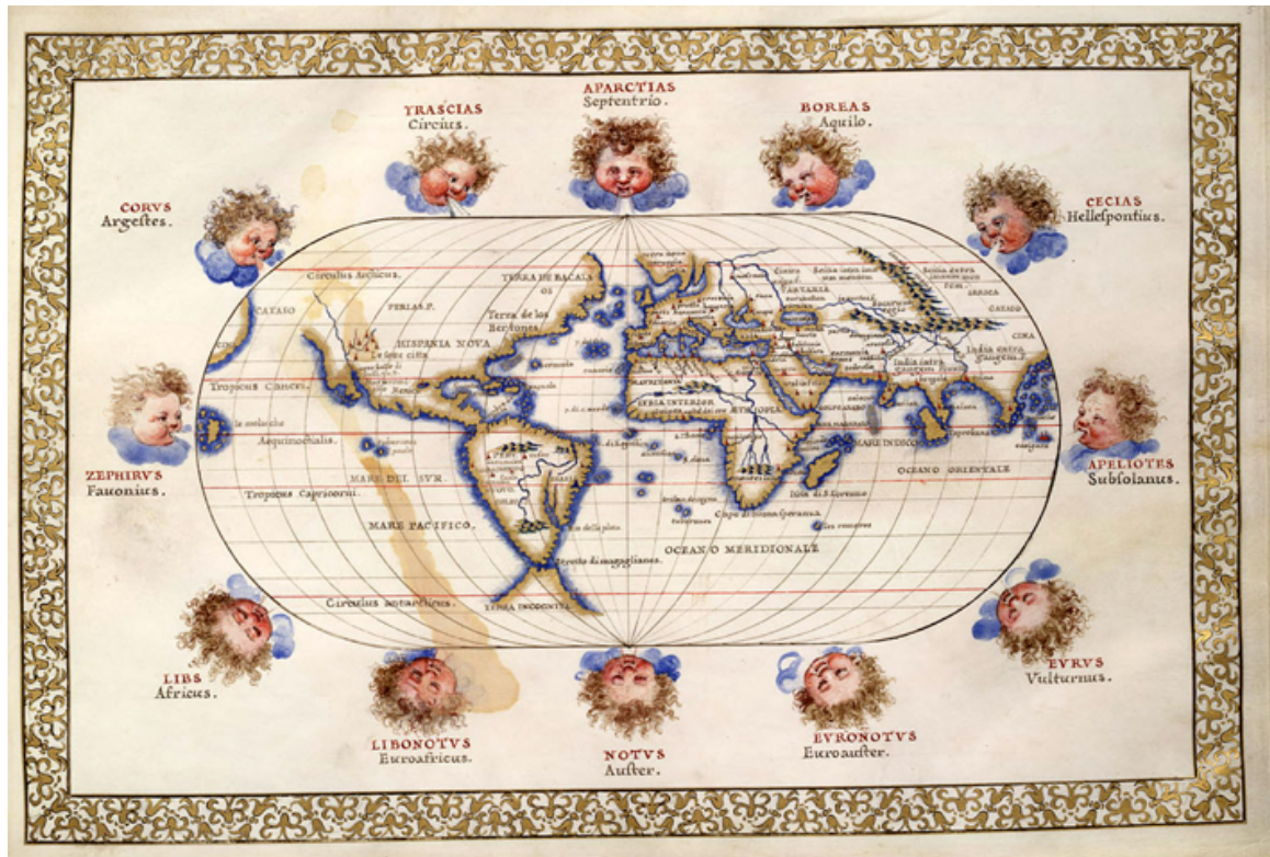
Francesco Ghisolfi Portolan Atlas: World