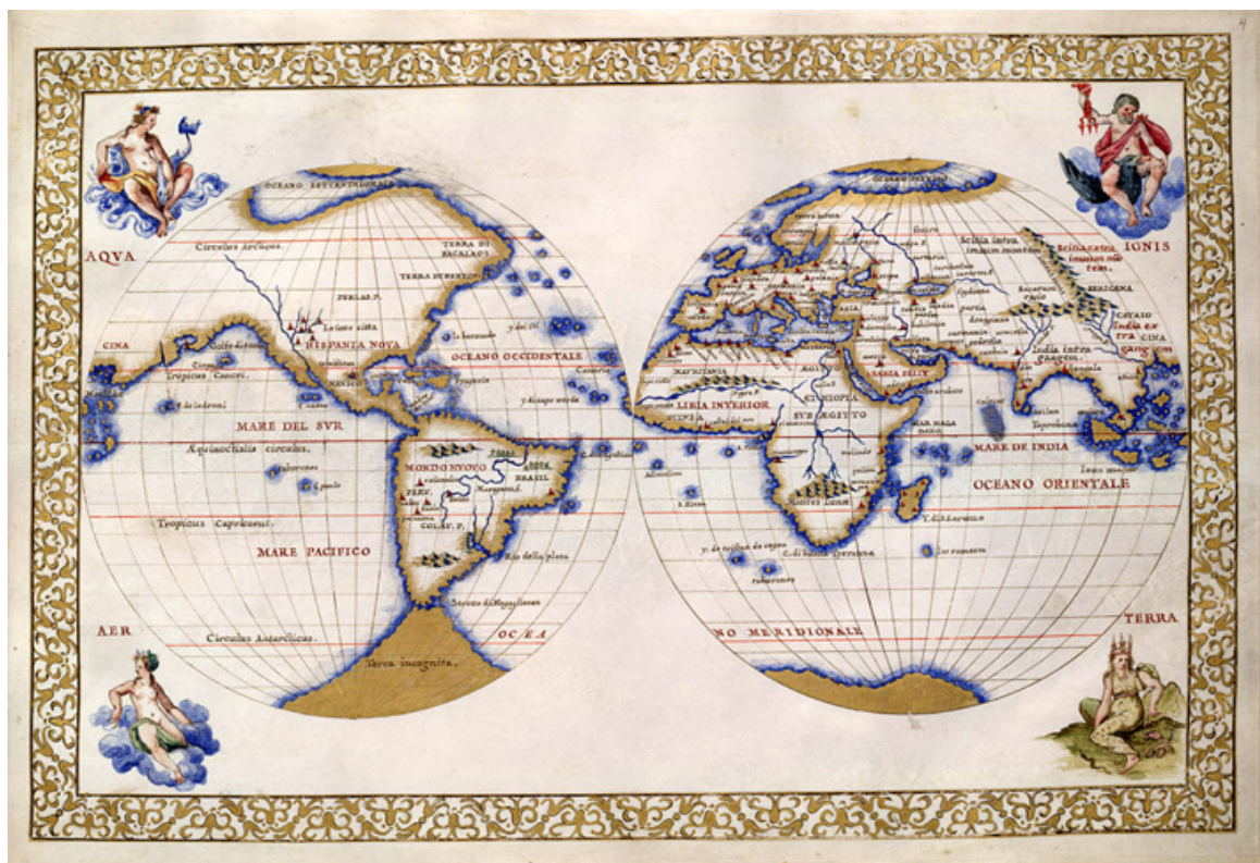
Francesco Ghisolfi Portolan Atlas: World