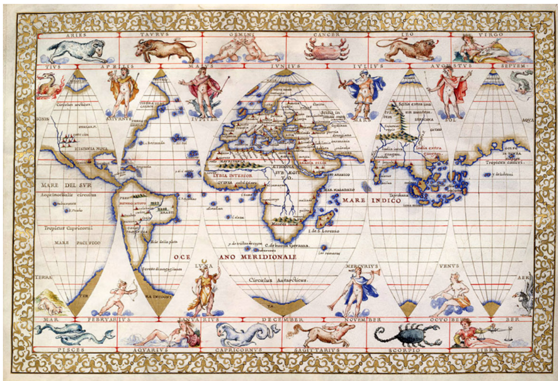
Francesco Ghisolfi Portolan Atlas: World