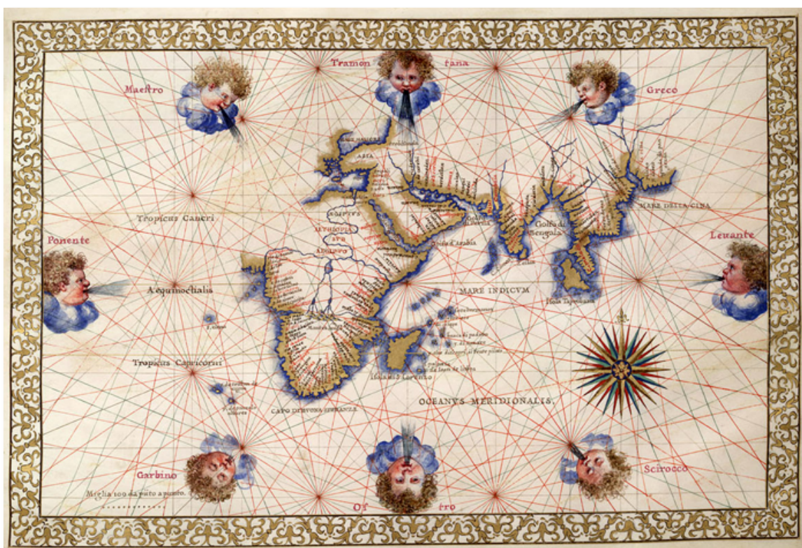
Francesco Ghisolfi Portolan Atlas: Eastern Hemisphere