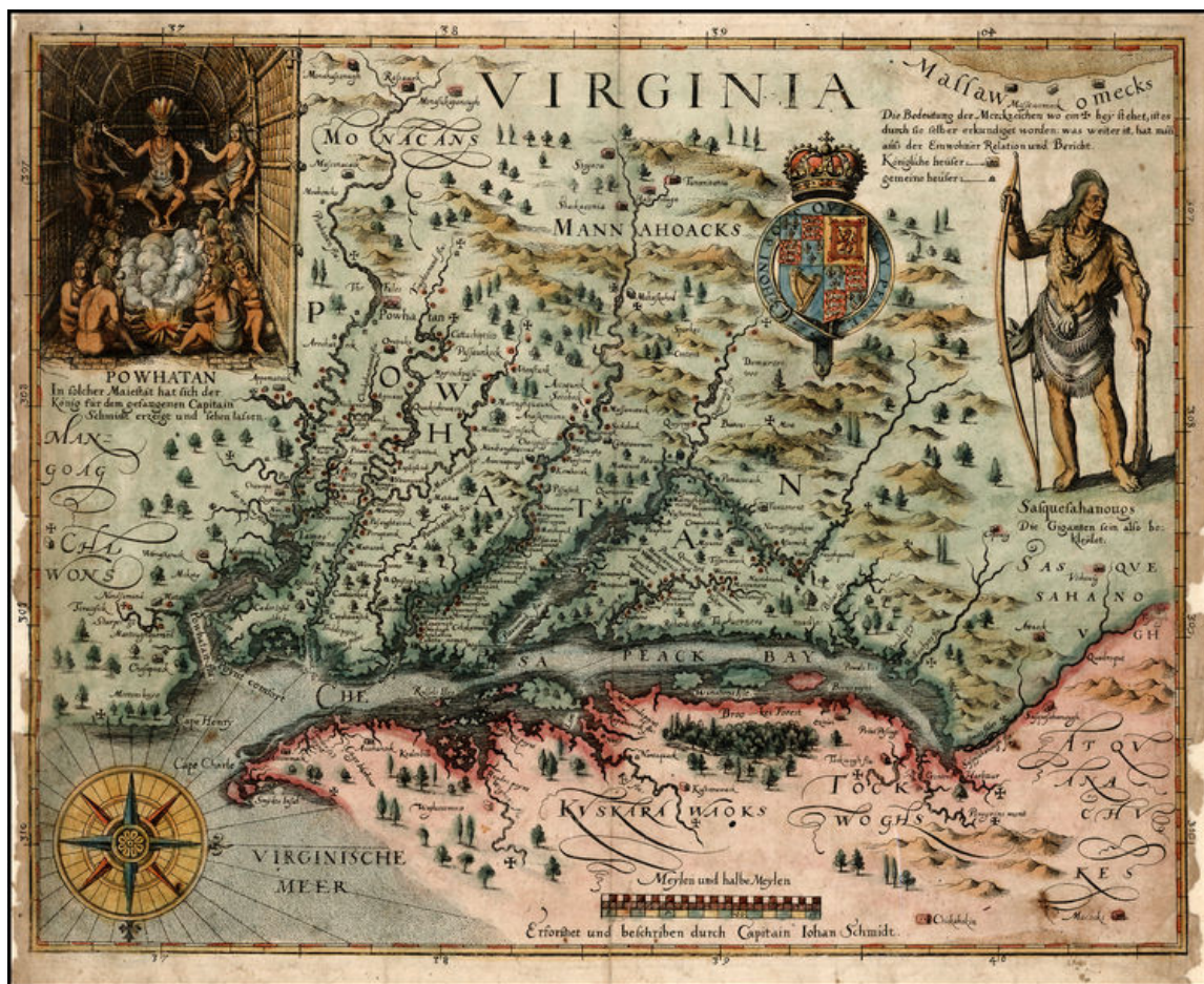
1627 Frankfurt edition