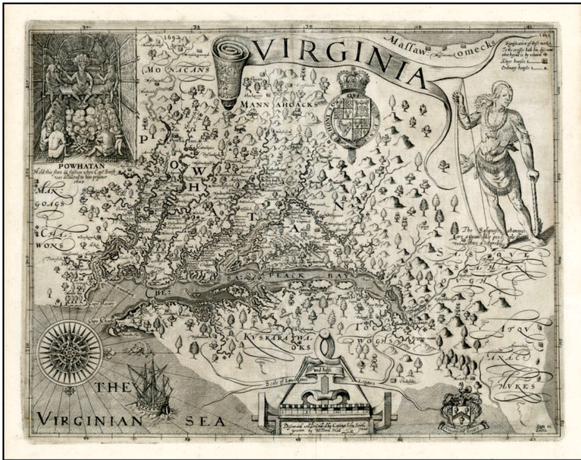
Virginia. Discoverd and Discrib'd by Captain John Smith . . . 1606 (London 1612-25 edition)