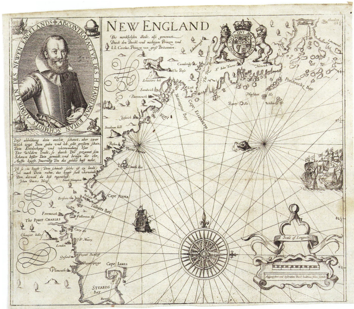
New England. SMITH, CAPT. J./HULSIUS, L. [Frankfurt, 1617] New England. 11x13.5 inches.