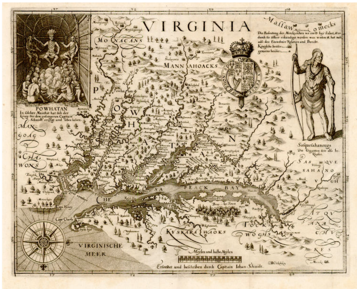
Frankfurt 1627 edition

An example of John Smith's seminal map of Virginia, which appears in part 13 of Theodore de Bry's Grand Voyages, Dreyzehender Theil Americae , published posthumously by De Bry's son-in-law, Matheus Merian.