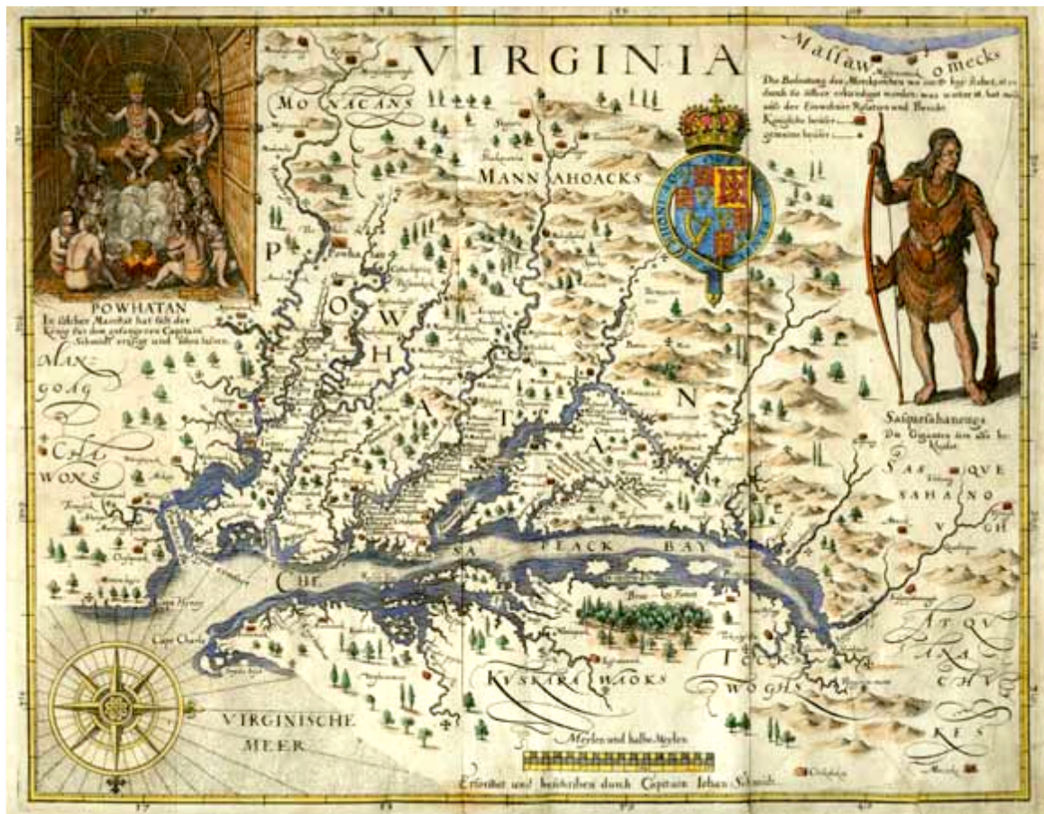
1628 German edition