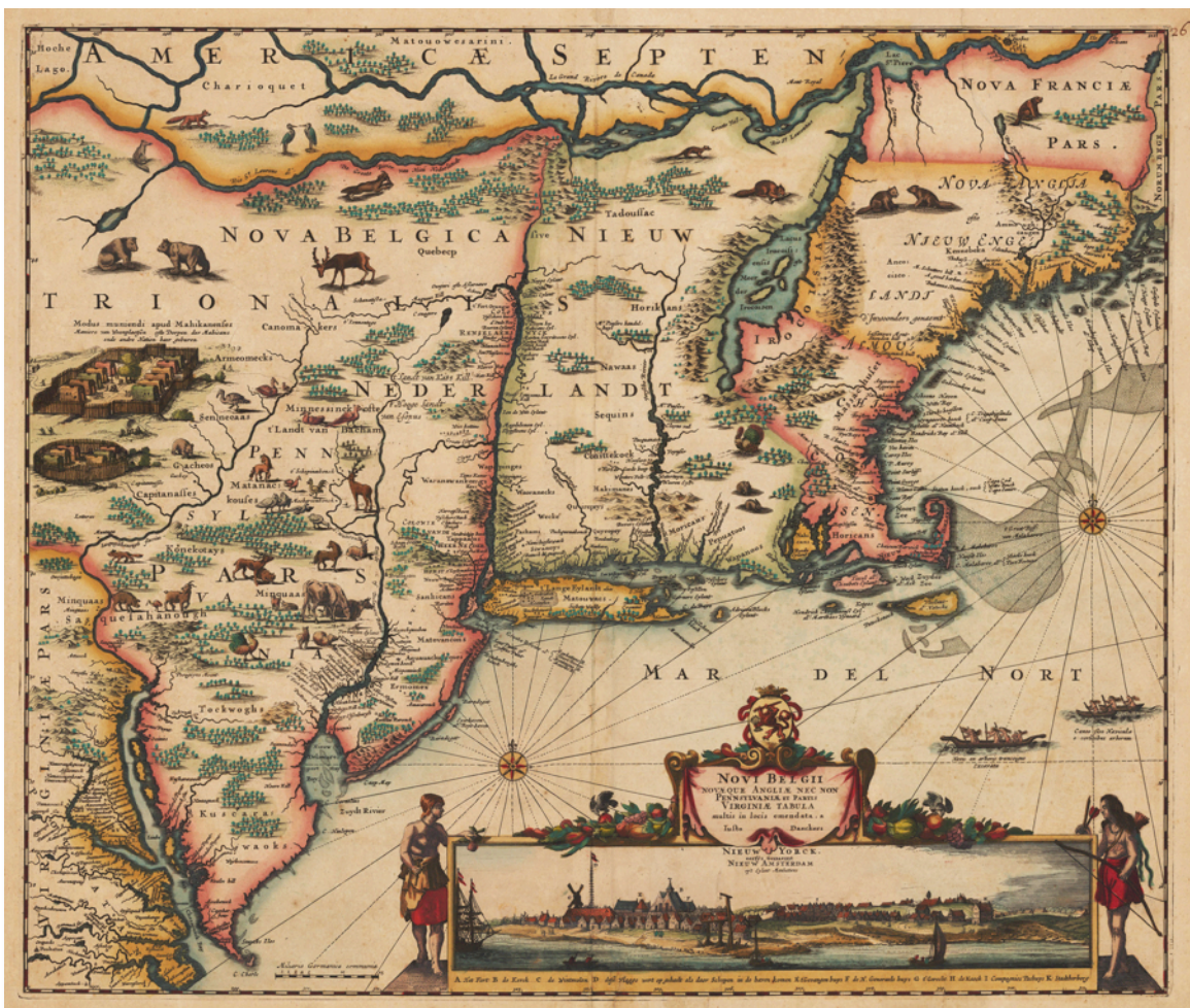
At the bottom of the map is a striking inset view of New Amsterdam showing period houses, ships in the harbor, a windmill, and even a gallows! To either side of the inset are two female Indian figures, allegorical representations of America.