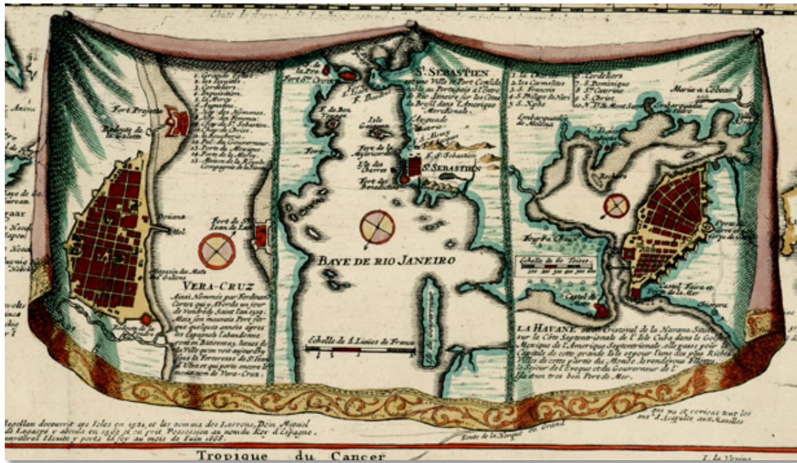
The ports of Vera Cruz, Rio de Janeiro and Havana