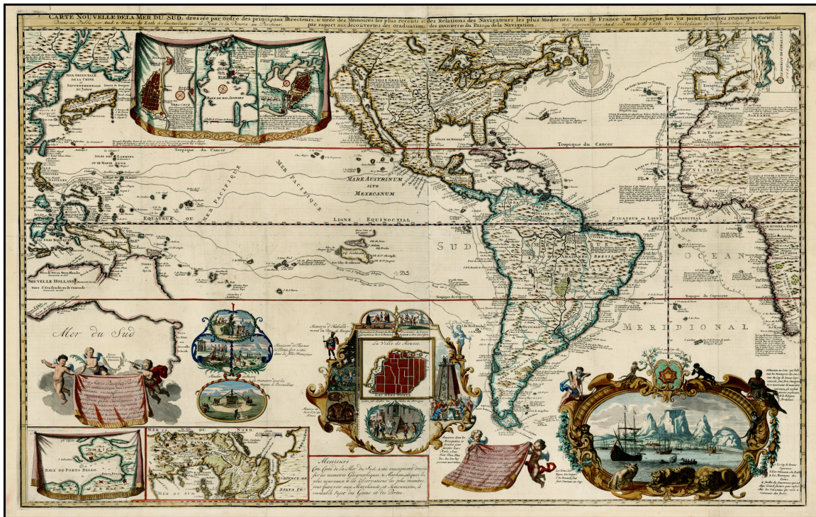
Carte Nouvelle de la Mer du Sud, dressée par Ordre des principaux Directeurs des Memoires les plus récents et des Relations des Navigateurs les plus Modernes . . .