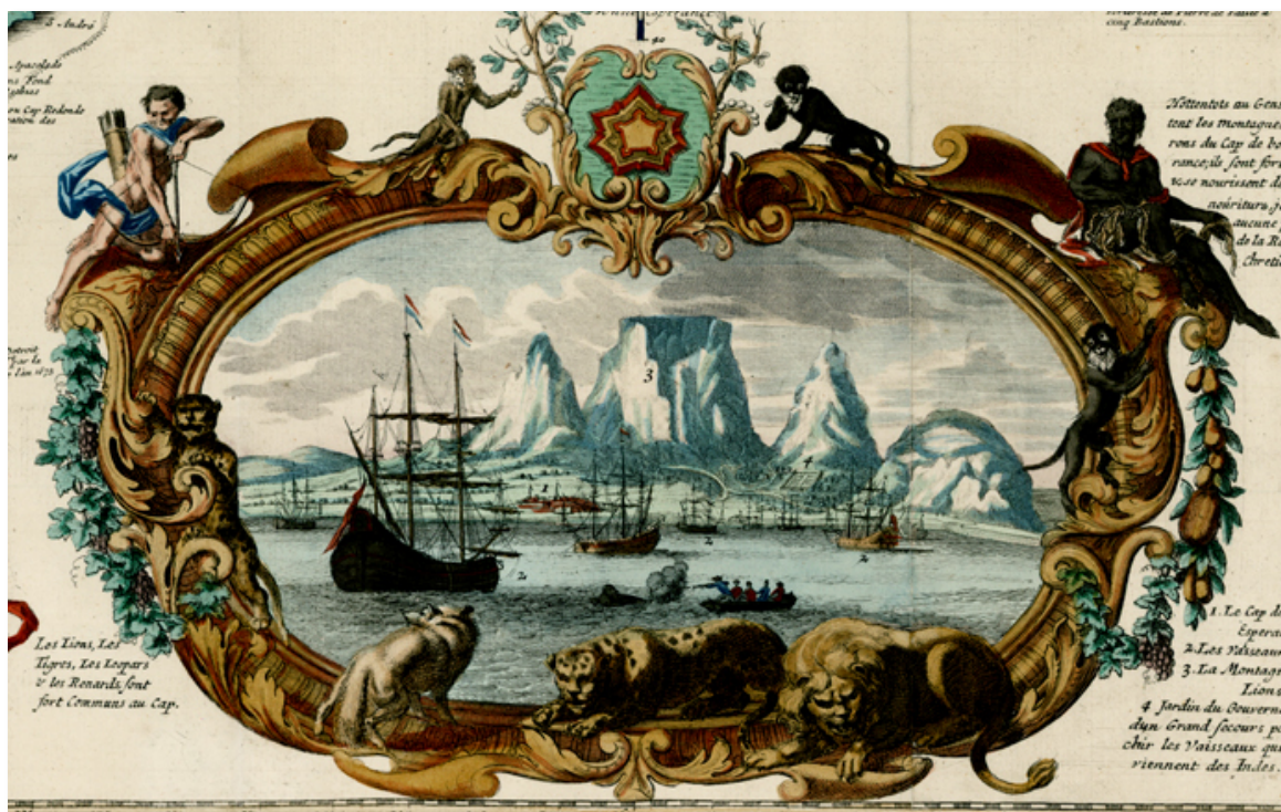
Port at the Cape of Good Hope

References: McLaughlin #220; Leighly #169; Tooley, Mapping of America , #94, p.133; Norwich 320.